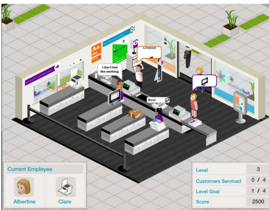
Figure 3: Dissaffected!