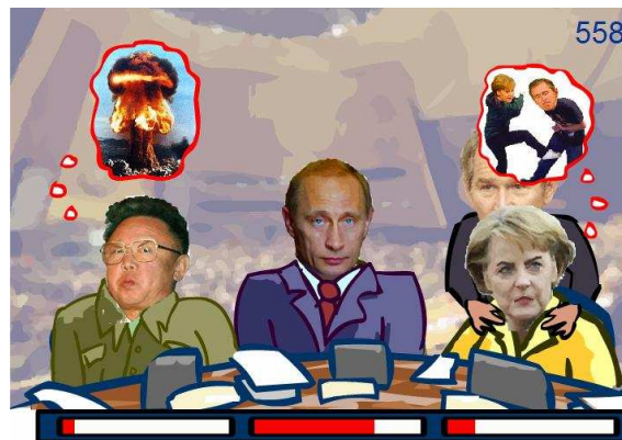
Figure 4: Bush Backrub

Dissaffected! [10], an “anti-advergame” from Persuasive Games released in January of 2006, provides a contemporary example of a political game making use of the service mechanic (see figure 3). Dissaffected! is a videogame parody of a Kinko’s copy store. As dissatisfied customers line up in the store, the player confronts obstacles such as fellow employees who refuse to work, or who indiscriminately move customer orders around. As is characteristic of service games, each customer has a time limit within which the player must satisfy their order. If too many customers angrily leave the store with their orders unfilled, the game ends.