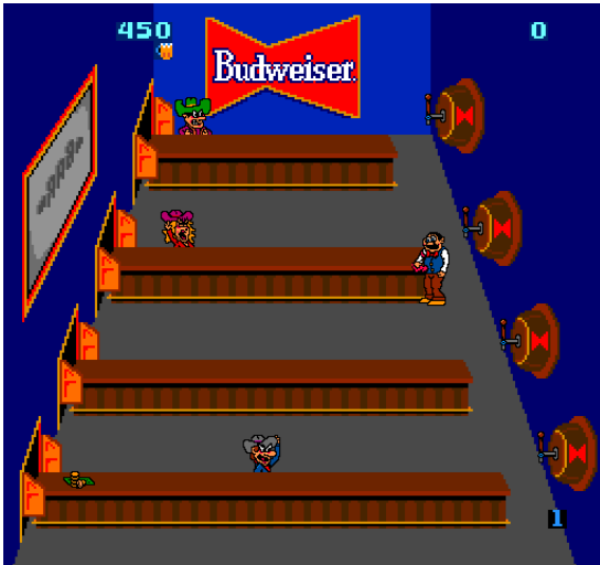
Figure 1: Tapper

not properly assembled before it reaches the end of the conveyor belt, it falls on the floor and the player loses points.